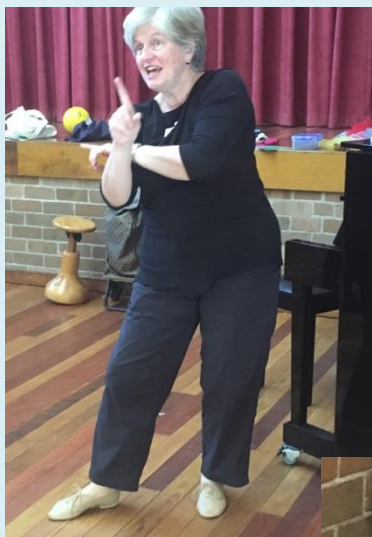
The balance stool